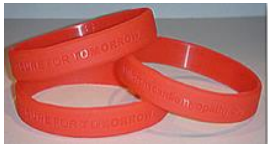
A Cure for Tomorrow Curebands – $5 for 2