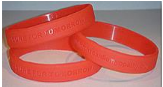
A Cure for Tomorrow Curebands – $5 for 2