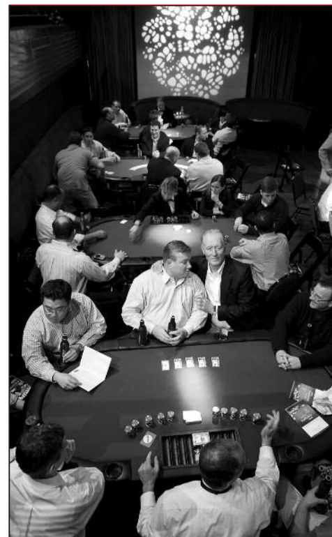
Attendees playing poker at Strata