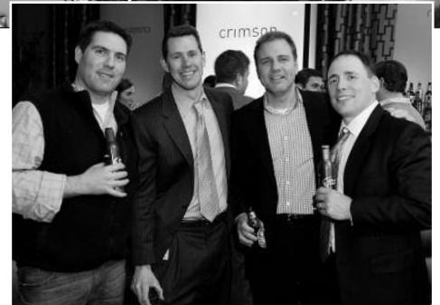
Top photo: Playing poker at Crimson